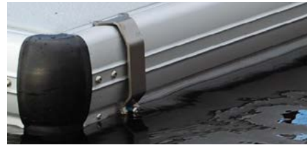
Deadweight bracket made of stainless steel