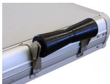
Roll for launching