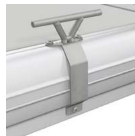
Stainless steel cleat